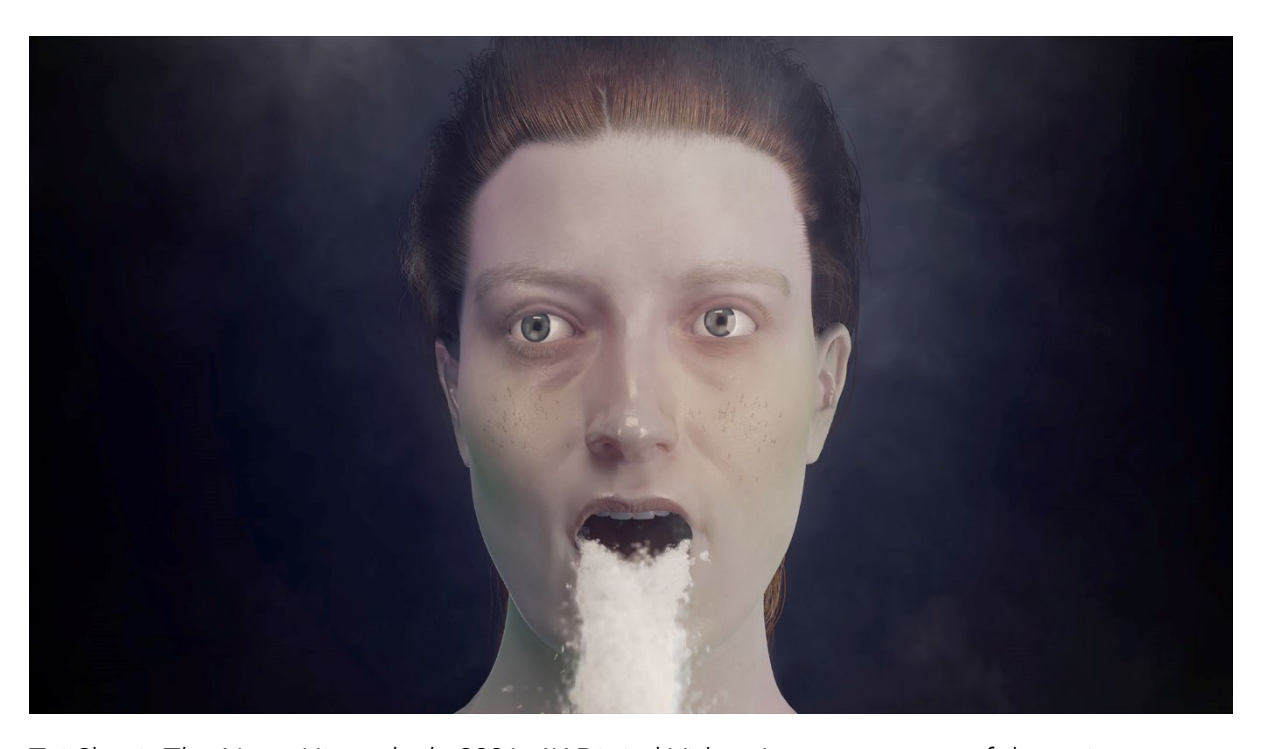
Tai Shani, The Neon Hieroglyph, 2021, 4K Digital Video.