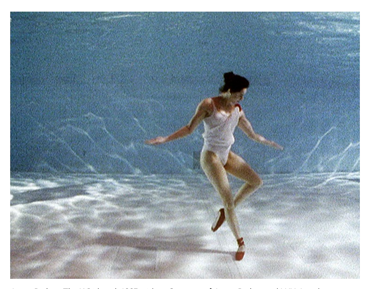
Jayne Parker, The Whirlpool , 1997, video. Courtesy of Jayne Parker and LUX, London.