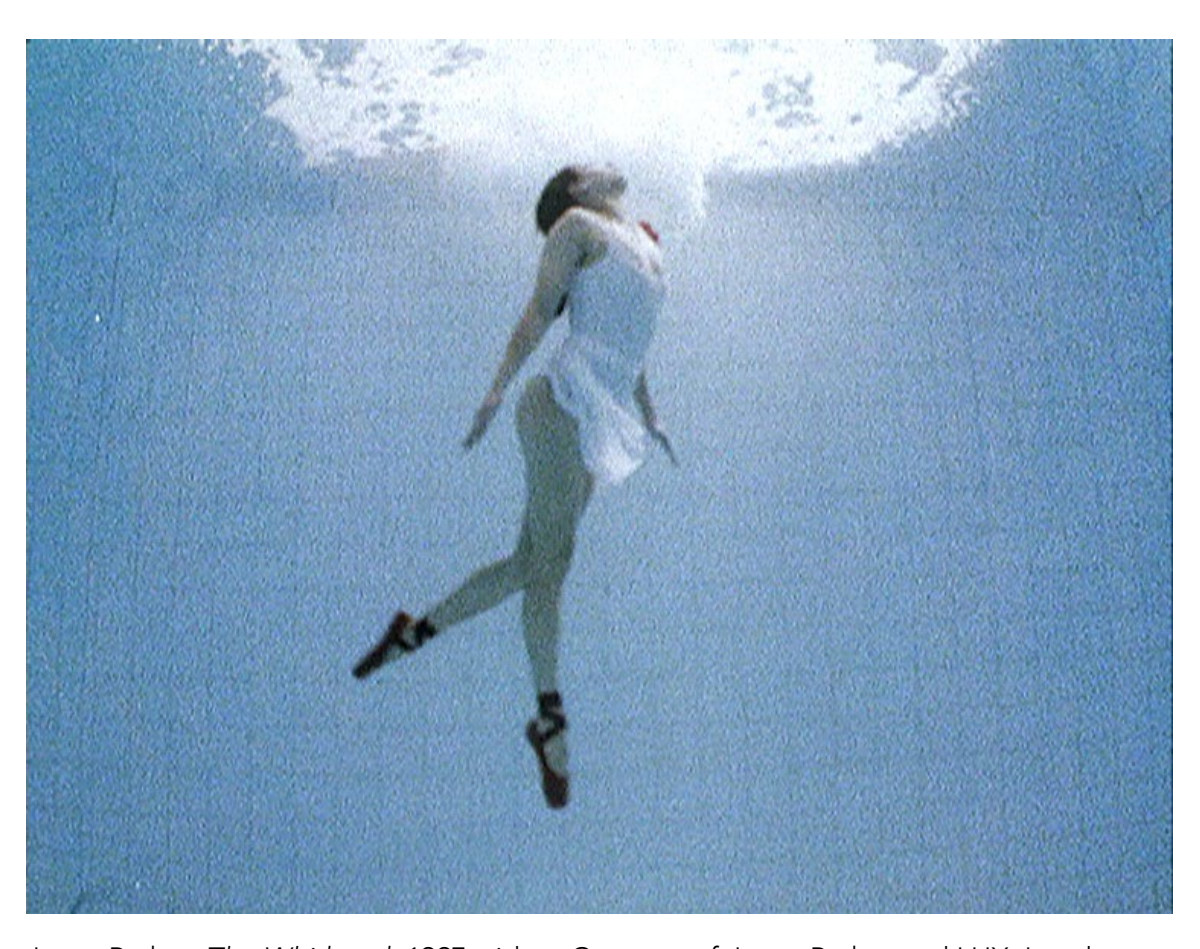
Jayne Parker, The Whirlpool , 1997, video.